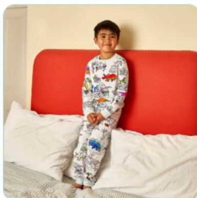
DINOSAUR COLOUR IN PYJAMAS