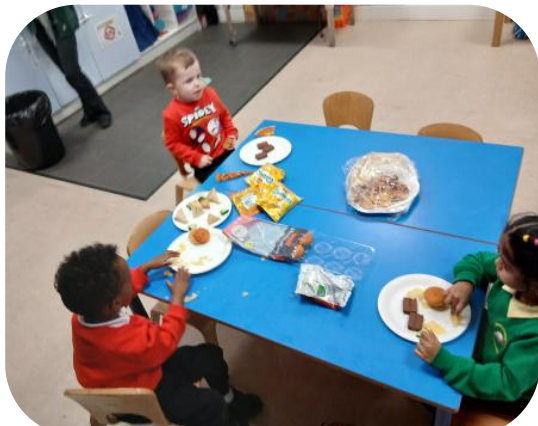
Rainbow Class had a lovely time at their Christmas party. The children enjoyed dancing to the festive music, singing and eating delicious food. They were very excited when they had a special surprise visit from Santa Claus .