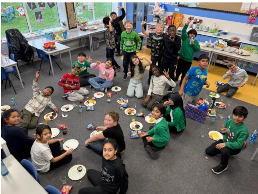
Year 4 had a great time dancing and sharing all the lovely food they brought for their class party!