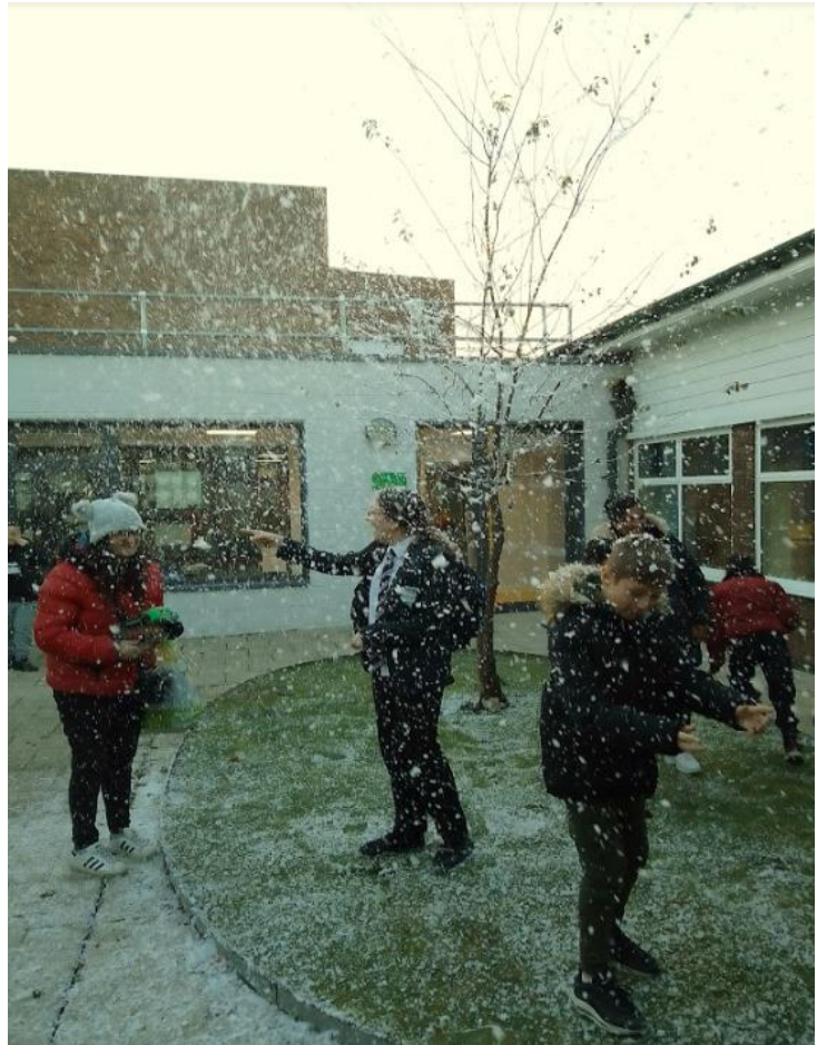
Fun in the snow!