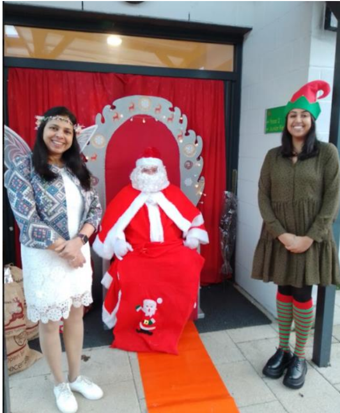
Santa and his helpers