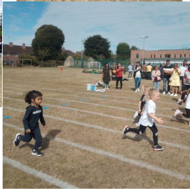
Nursery, Reception and Year 5 Sports Days