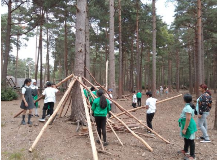
Year 4 had a fantastic trip last week to The Lookout Discovery Centre in Bracknell Forest. They learnt about science and nature, they were able to explore the woodland and made bivouacs.