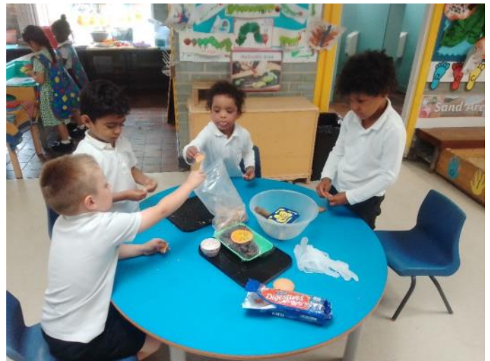
In celebration of Eid, the Nursery children made Eid biscuits. Some children created Eid cards too. Happy Eid!