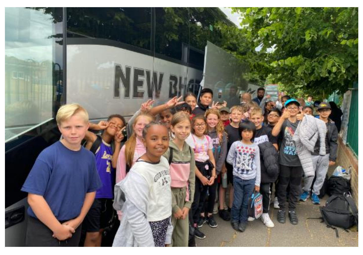
Some of Year 6 heading off for their weekend residential. I'm sure they will have a fantastic time. Watch out next week for more photographs.