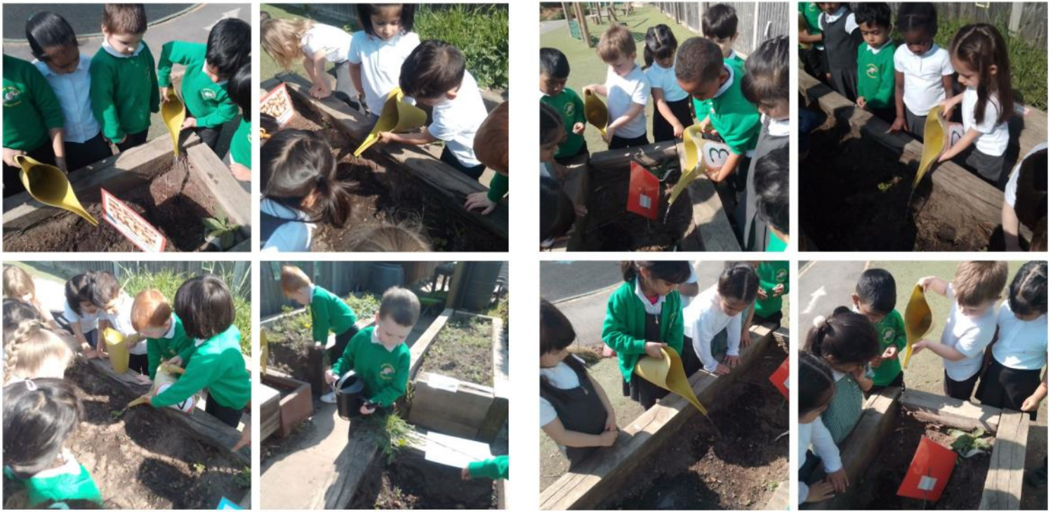
Nursery children have been busy looking after the potatoes we have planted in our garden. The children have been watering the potatoes. Well done Nursery!