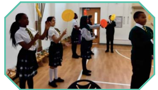
On 12th June children from Christ Church, Brondesbury took part in circus skills workshops hosted by "The Workshop Company".

(photos - Y6 children practising their skills)