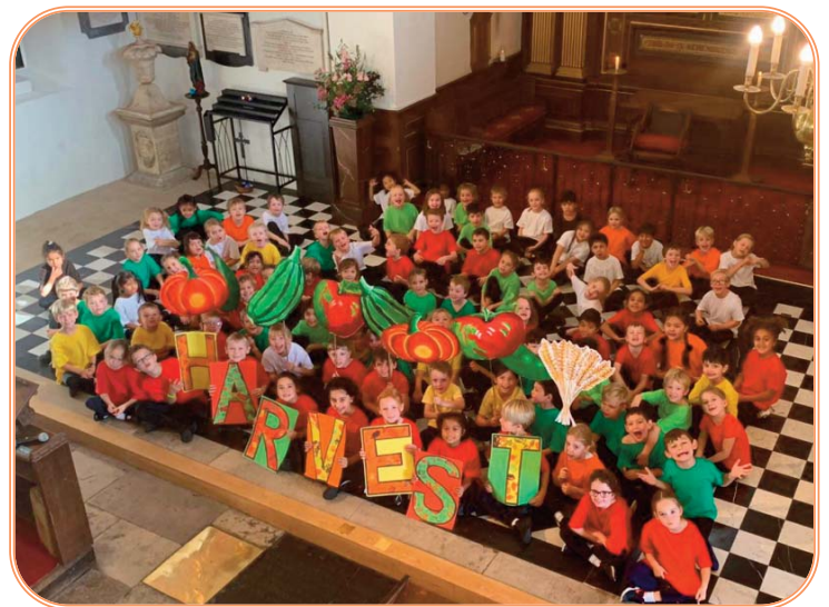
St Mary's, Twickenham celebrated Harvest at St Mary's the Virgin Church .